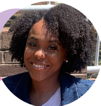
Mariah Hicks College Prep Panel