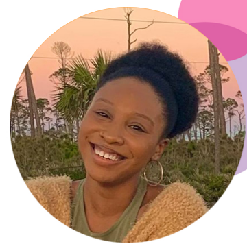
India Young College Prep Panel