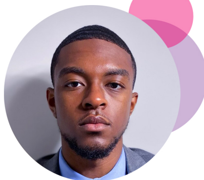
Andrew Nutall College Prep Panel