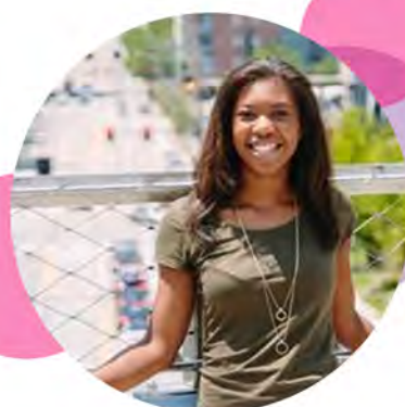
Kennedy Guidry College Prep Panel