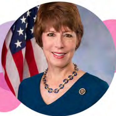
The Honorable Gwen Graham Women in Politics & Leadership